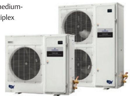
Copeland digital X-Line Series

The Copeland™ digital outdoor refrigeration unit, X-Line Series is built upon field-proven Copeland scroll compressors to support medium-temperature loads in multiplex refrigeration systems and deliver the associated benefits of variable-capacity modulation.